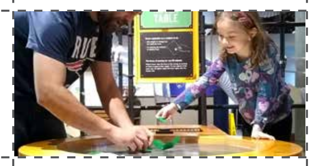
1st floor: AirWorks