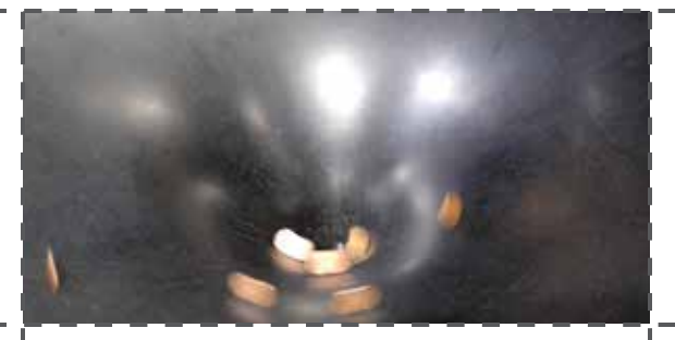
1st floor: Penny Well