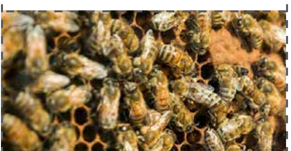
2nd floor: Honey Bees