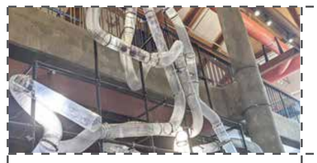
1st floor: AirWays