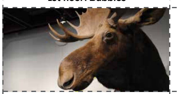
1st floor: The Moose