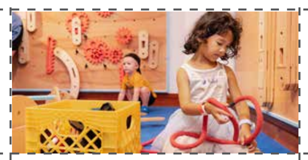
1 2nd floor: Creative Building Center 1