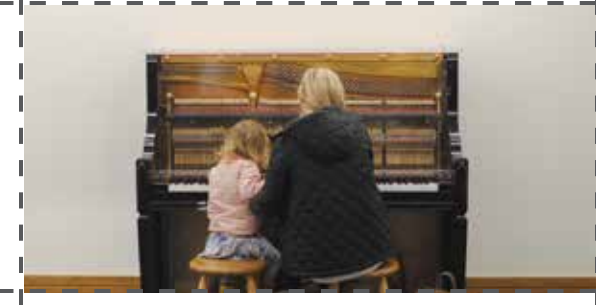
1st floor: The Piano