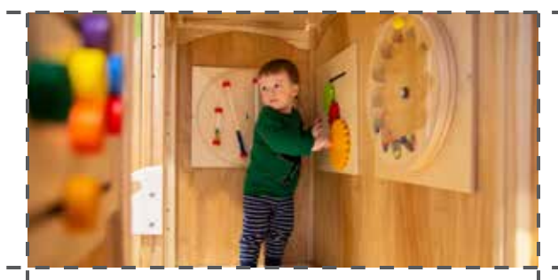
1st floor: Wonder Woods