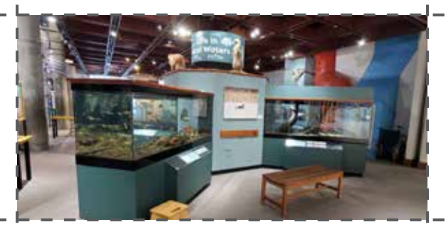
1st floor: Life in Local Waters