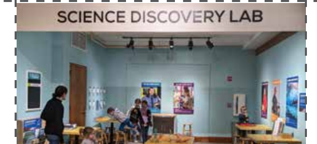
2nd floor: Science Discovery Lab