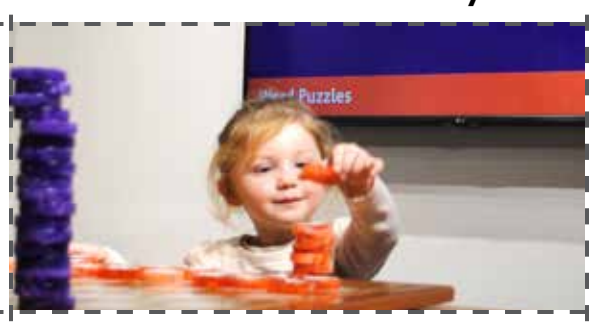
2nd Floor: Solve It!