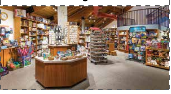
1st floor: Museum Store