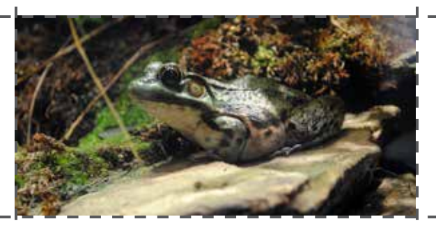
1st floor: Frogs and Toads