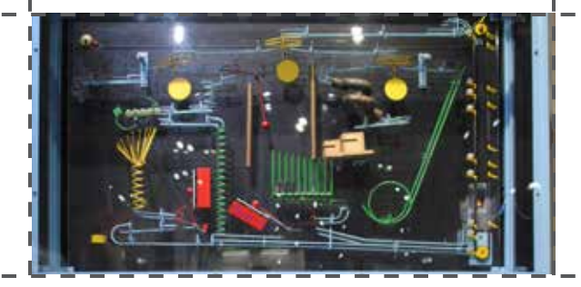
1st floor: Ball Machines