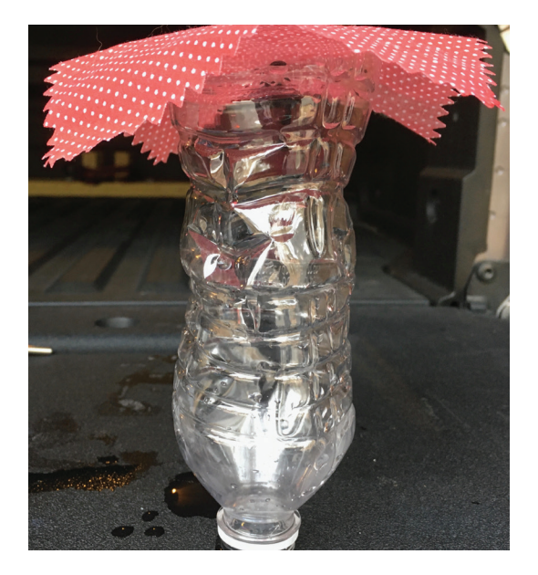
2 - Cover the open bottom of the bottle with your fabric or sock, and secure it with a rubber band.