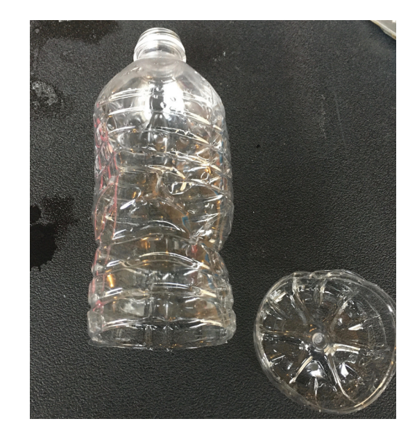
1 - Cut off the bottom of the bottle. (Please ask an adult!)