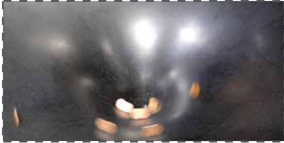
1st floor: Give it a Whirl