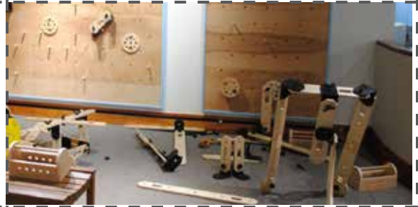
2nd floor: Creative Building Center