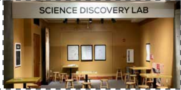
2nd floor: Science Discovery Lab