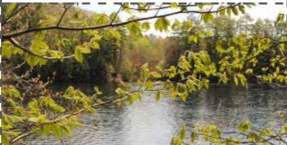
Outdoors: River Loop Trail