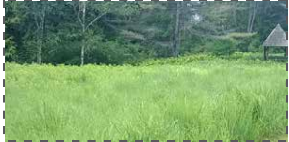
Outdoors: Meadow Walk