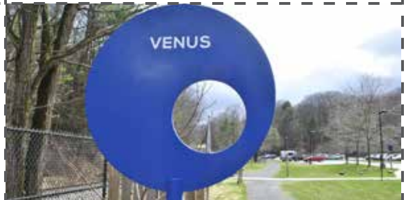
Outdoors: Planet Walk