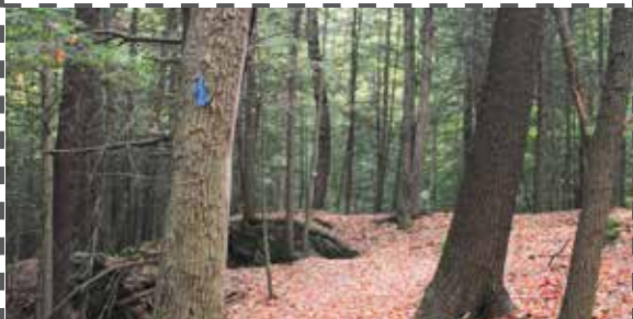
Outdoors: Ridge Trail