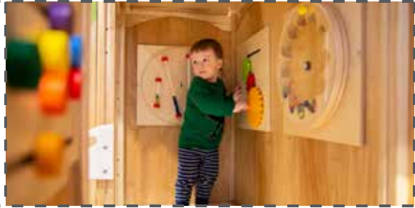
1st floor: Wonder Woods