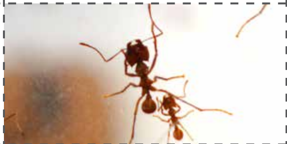
1st floor: Leafcutter Ants