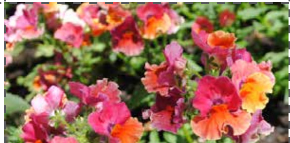
Outdoors: Venus Garden