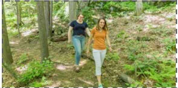
Outdoors: Woodland Garden