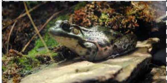
1st floor: Frogs and Toads