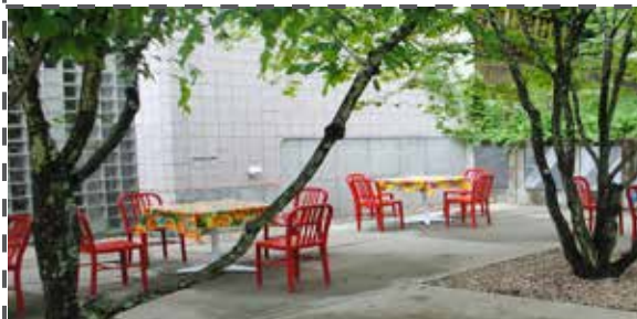
Outdoors: Dining Space