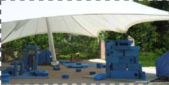
Outdoors: Blue Blocks