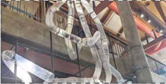
1st floor: AirWorks