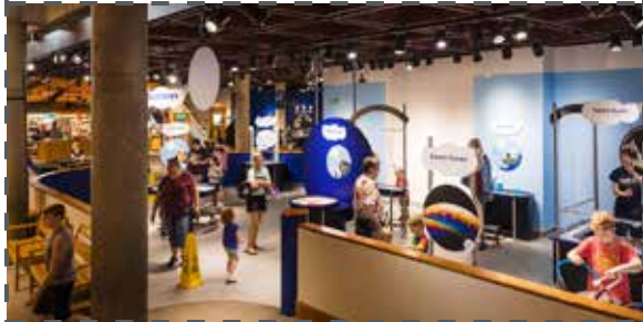
1st floor: Bubbles