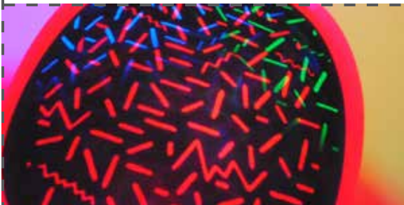
Tower: Light Around Us