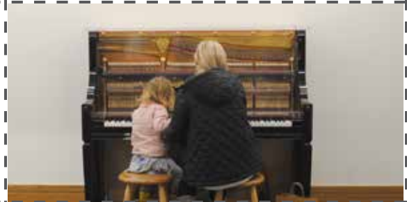
1st floor: The Piano