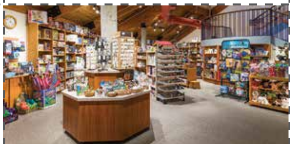
1st floor: Museum Store