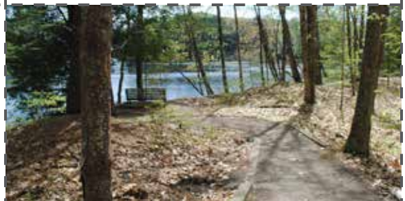
Outdoors: Blood Brook Trail