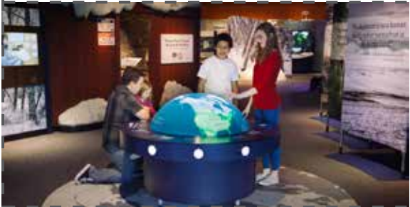
2nd floor: Under the Arctic