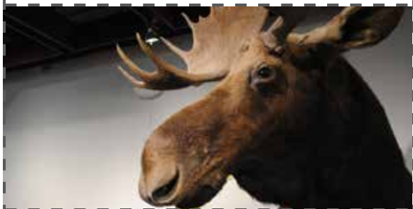
1st floor: The Natural World