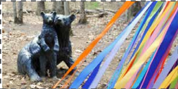
Outdoors: Play Grove