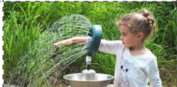
Outdoors: David Goudy Science Park