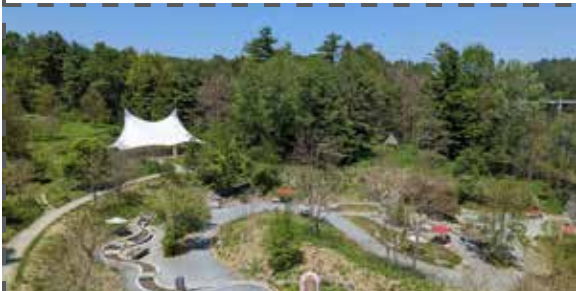
Tower: Observation Deck