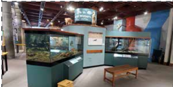
1st floor: Life in Local Waters